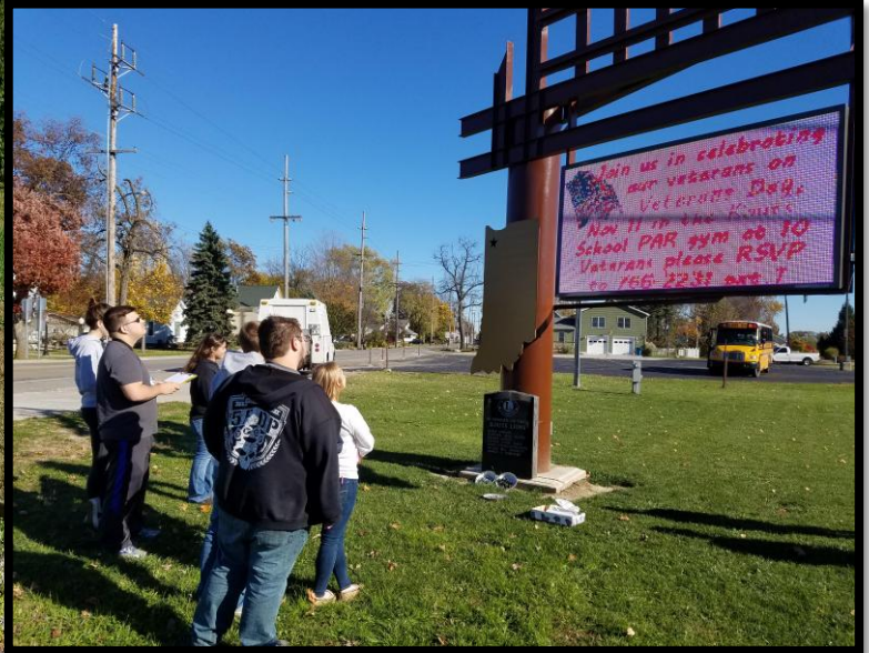
Our students' work will be landscaping the area around this city sign.