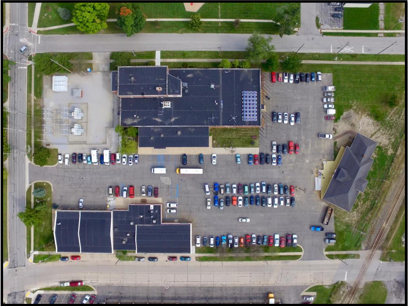
You get a good perspective of the Depot on our lot and also our wind and solar project located on the roof of the main building.

I CARE MORE ABOUT THE PEOPLE MY STUDENTS BECOME THAN THE SCORES ON THE TESTS THEY TAKE. facebook.com/IAppreciateTeachers